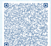
Sign up to our Newsletter